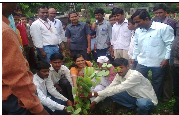
Tree plantation programme at Manjarath