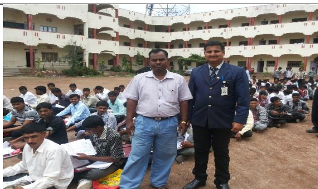
Security guard selection program At Manjarath