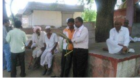
Visit to Rural Place about Ergot of Bajara