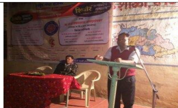
N.S.S.Shibir a speech on Environment