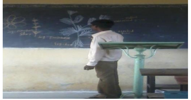
Wall paper presentation