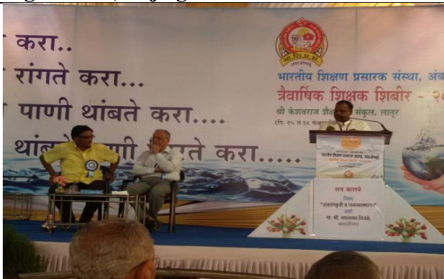
Shakshaksibir-at latur Introduction Hon.Mahadevrao chitle (Jaltyadnaya)