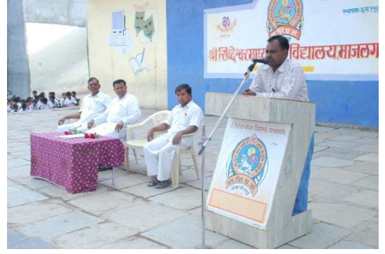
Kargal Vijay Divas-speech in Shri Siddheshwar Vidyalaya, Majalgaon