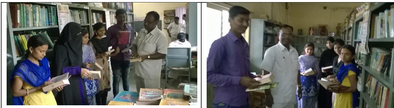
Library hour B.Sc.T.Y.(2011-2012)