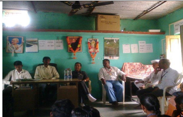
Visit to GRAM PANCHAYAT AT Manjarath